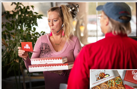
Sweet! Who sent us Duffeyrolls!?